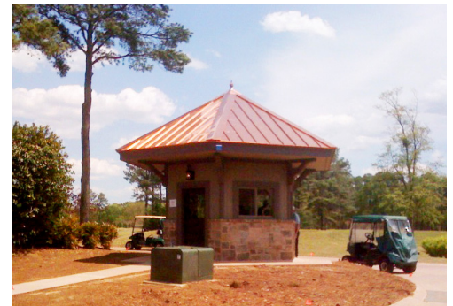
Atlanta Athletic Club 1930 Bobby Jones Drive Johns Creek, GA 30097