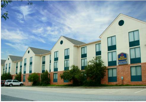
Best Western Holcomb Bridge 907 Holcomb Bridge Road Roswell, GA

Check out any Roof 911 Construction project first hand. You will see that we are not only doing superior restorations but also taking integrity to the highest level.