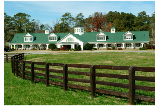
Blue Valley Stables 4120 Canton Road Marietta, GA