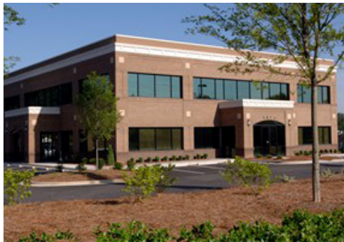
Roberts Commercial Properties 9875 Medlock Bridge Parkway, Suite 200 Johns Creek, GA